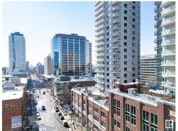
701-10136 104 Street NW, Edmonton, AB